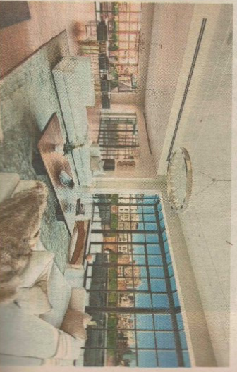
▶ Puck Penthouse 1, 293 Lafayette Street, New York City, US, $58.5m

Who Home Hunts, home-hunts.com, tel: +33 970 44 66 43