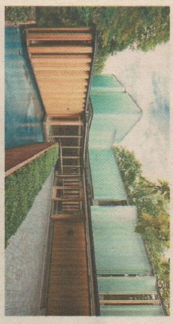
▶ The Integral House, 194 Roxborough Drive, Toronto, Ontario, Canada, C$22.9m ($17.6m)

Where In Toronto's Rosedale neighbourhood, a 30-minute drive from Toronto Pearson International airport.