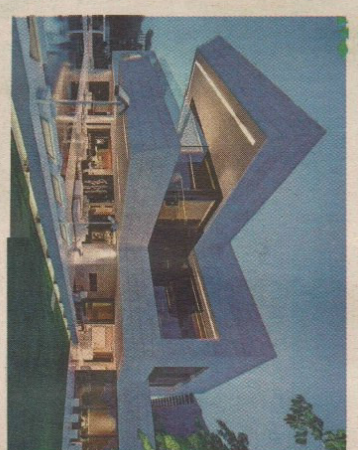
▶ El Nido, Cascada de Camoján, Marbella, Spain, €2.5m

Where Within a gated community in the foothills of La Concha mountain on the Costa del Sol, Málaga international airport is 35 minutes by car.