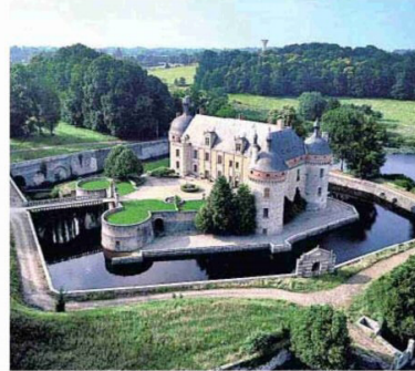
Château-Fortress France (Limoges) Price: €4.24m (£3.14m)

Agent: Home Hunts (020 8144 5501; home-hunts.com )