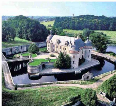
Château-Fortress France (Limoges) Price: €4.24m (£3.14m)

Agent: Sotheby's (01932 860532; sothebysrealty.co.uk )