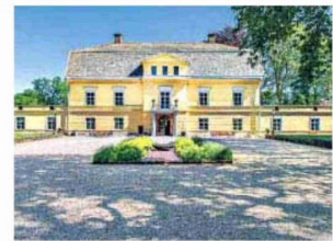
Hönäster Castle Sweden Price: $5.6m (£3.78m)

As China's richest man snaps up an £80m pad in London, Anna Partington opens the door to a world of fairytale castles, chateaux and mansions, all at fantastical prices