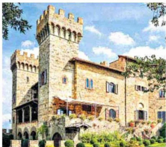
Royal Castle Italy (Chianti) Price: €9.5m (£4m)

Agent: Christie's (0046 8 662 68 00; christiesrealestate.com )