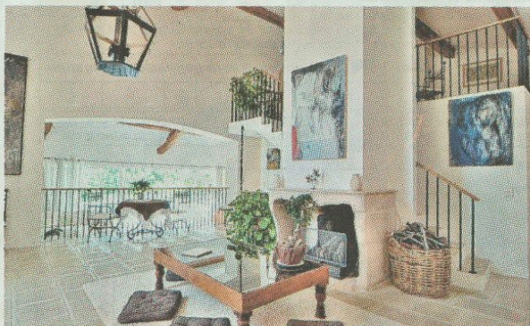
ELEGANT: A spacious living room in Clapton's French retreat

'The fact that Provence property prices have dropped by ten to 15 per cent over the past few years is also a big factor too,' he adds.