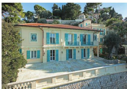
Belle Epoque Villa, Cap Ferrat €28,000,000

Ideally situated on Saint Jean Cap Ferrat, this renovated Belle Epoque villa enjoys panoramic sea views over the bay of Villefranche and has private access down to the sea. With 700 sqm of living space on a landscaped garden of 2,255 sqm with a heated infinity swimming pool, it has a large reception room opening onto a terrace, a master suite with living room, dressing room and bathroom, five further bedrooms with bathroom or shower, gym, guest/guardian apartment and double garage and parking.