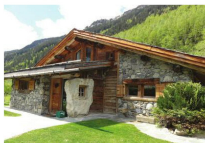
Cham La Forge Chalet £2,490,000

This fully renovated 18th century farmhouse is set in over 4,250 sqm grounds and just 600 metres from the famous Grand Montets cable car in Argentiere. The chalet (once the village forge in the 1800s) has a large master bedroom with separate shower and bathrooms and smaller children's bedroom on the first floor. On the ground floor there is an open plan kitchen/ living and dining area with central fireplace, WC, utility room and en suite bedroom. The property has an outbuilding (40 sqm), which is currently used as a gym, a three place semi-underground garage and a wine cellar underneath. There is more than enough space for an outdoor pool, helipad and/or tennis courts in the grounds.