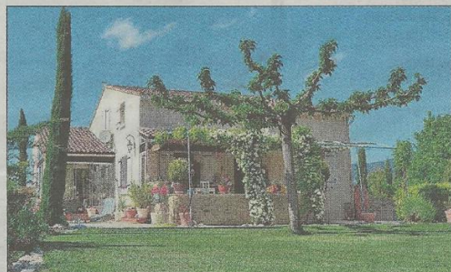
£476,000: five-bedroom house in Bedoin, near Crillon le Brave, with gardens, a pool and good views of Mont Ventoux. Through Janssens Immobilier (see Knightfrank.com)

bargains at local markets. The antiques market in nearby Carpentras was a fertile furniture source, along with the famous weekend markets at L'Isle-sur-la-Sorgue, number one with antiques hunters.