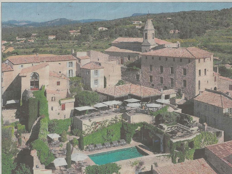
Provençal delight: stone houses of the Crillon le Brave hotel in the sleepy village it is named after, surrounded by fields of olives and vines

Lydon's background in the antiques industry came in useful for spotting