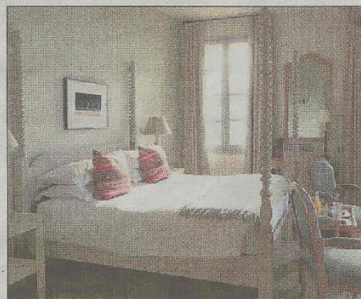
Understated luxury: rooms at stylish five-star Hotel Crillon le Brave start at £240 a night, including breakfast

In between the new-build homes at the foot of the village and the older homes up above, Crillon le Brave still has some stone originals awaiting a makeover. A Provençal mas – or farmhouse – of 1,800 square feet with five bedrooms and a pool is £690,500 through Maurice Garcin, while newer